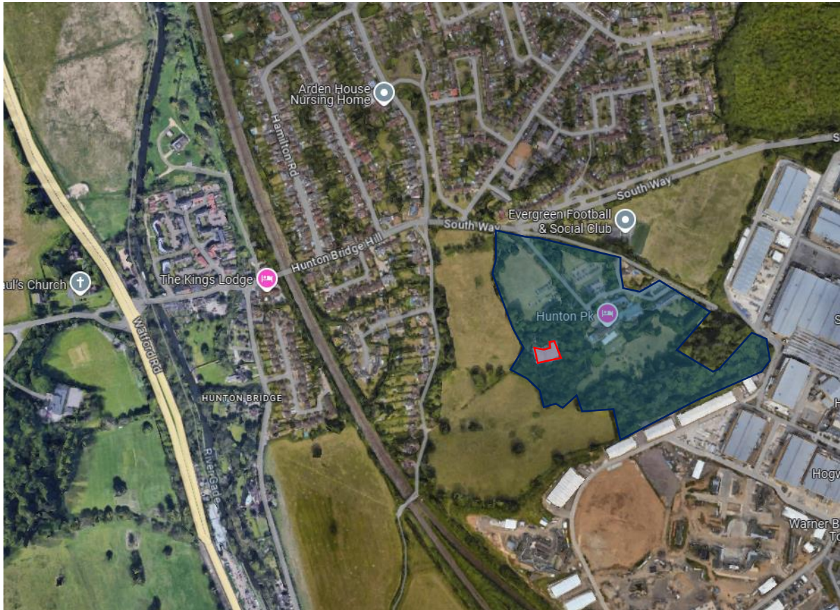
Above image courtesy of Google Maps